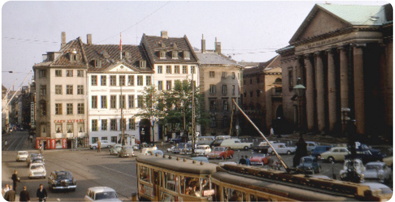
Nytorv Anno 1966